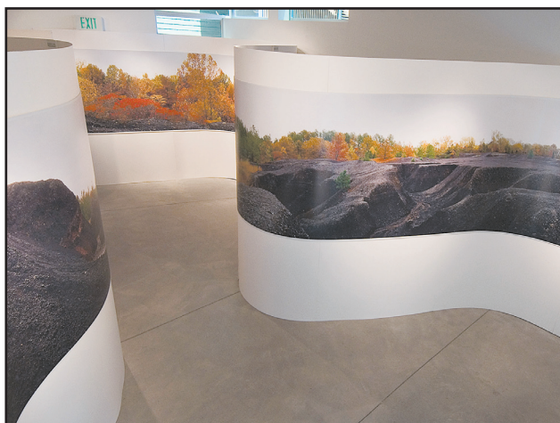
Two photographs, Fall Color and Black Canyon , form one winding installation in Jonathan Long's solo show at the Center for the Arts.

He visited various organizations in the area, ques-